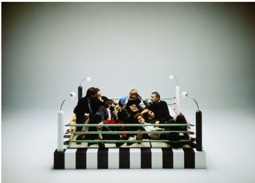
Memphis designers with Masanori Umeda's Tawaraya Bed, 1981.

Memphis: Plastic Field Extended opening date: Until 12 September 2021