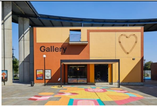
Art Fund 2021

On Saturday , I am going to a Toddle Exhibition Tour at MK Gallery.